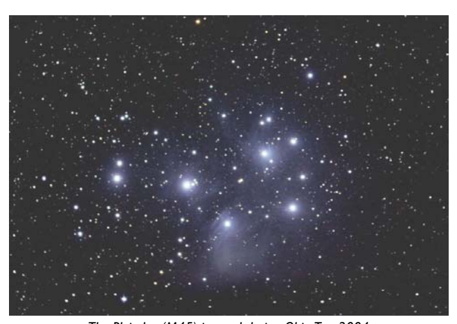
The Pleiades (M45) imaged during Okie-Tex 2004

park also encompasses Black Mesa itself which is a nature preserve.