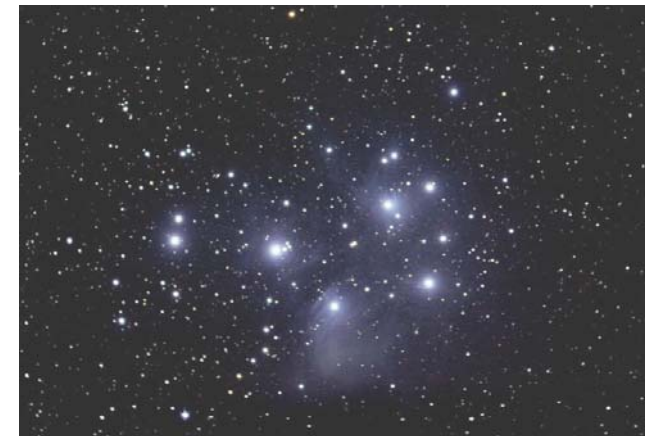
The Pleiades (M45) imaged during Okie-Tex 2004

Your Invitation to Okie-Tex Star Party 2014 Has Arrived!