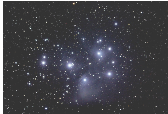
The Pleiades (M45) imaged during Okie-Tex 2004

Your Invitation to Okie-Tex Star Party 2011 Has Arrived!